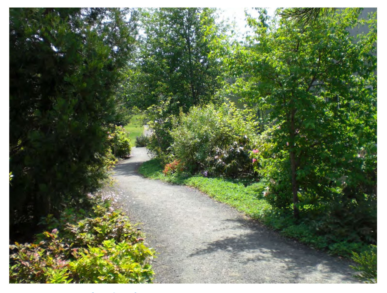
In the last 10 years, 450 trees have been planted on the 30<sup>th</sup> Avenue campus.