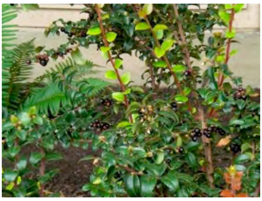
Our gardens use a minimum of 60% native plant material.

Non-native plants may be included if they provide a benefit for wildlife and are not invasive.