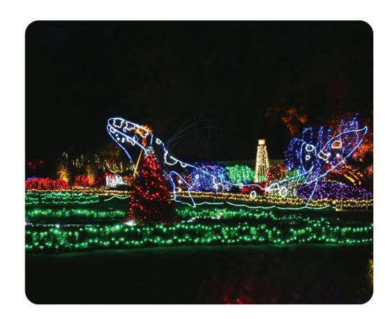
Shore Acres LCC Retiree's Bus Trip in December, 2015