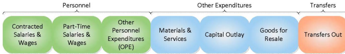
Figure 2: Operating Expenditure Categories, Funds I & IX

This section presents the major operating expenditure categories for Lane’s primary operating funds I and IX, and the methodologies used to analyze and forecast each category.