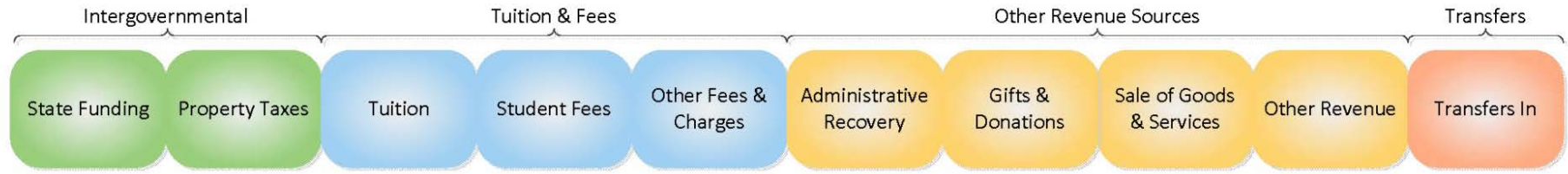
Figure 1: Operating Revenue Categories, Funds I & IX

This section presents the major operating revenue categories for Lane’s primary operating funds I and IX, and the methodologies used to analyze and forecast each category.