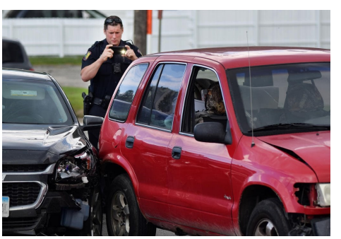
Please Note the LCC Department of Public Safety is a governed agency, which has access to DMV driver and vehicle information.

When running late, ample parking is usually available in Lot N (by the baseball field, across from Buildings 6, 7, and 8). Lot N is within a five-minute walk to the inner campus.