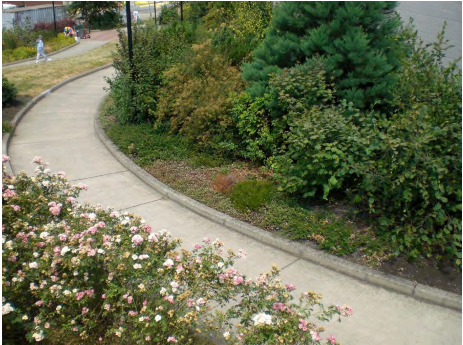
Habitat around Building 6